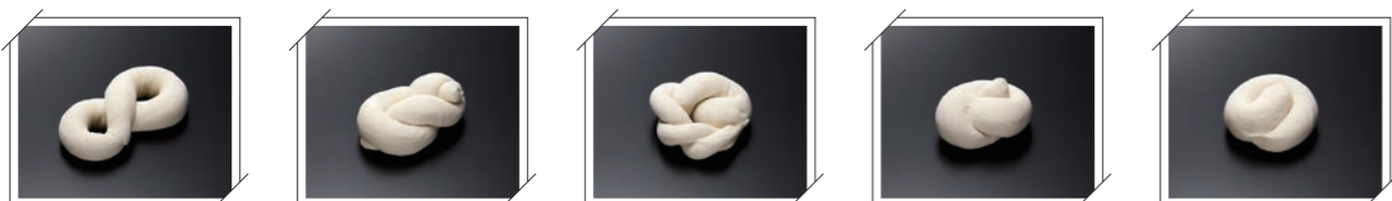
Figure eight Figure eight #2 Flower Single knot Half spiral