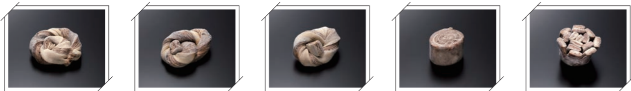
Snake Figure eight Single knot Spiral Rock