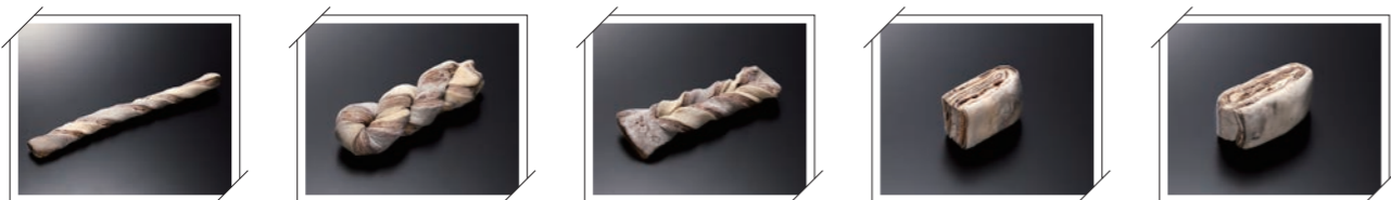
Twisted bar Twist Twisted konjac style Bifold Trifold