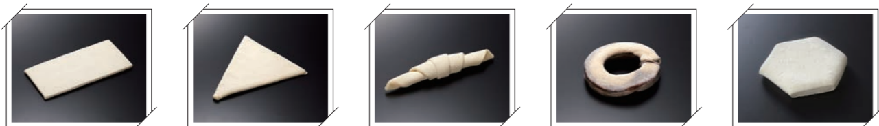
Board Triangle board Croissant Ring Hexagon